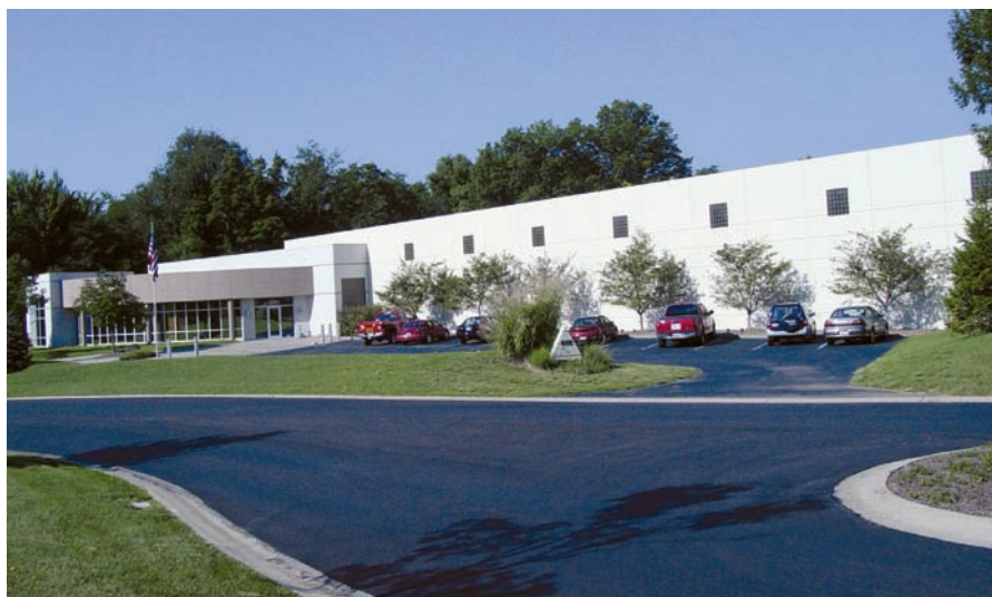
■ Gutter Topper conducts installation and marketing training at its corporate headquarters in Amelia, Ohio.

For more information, call 800-915-5888 or visit www.guttertopper.com .